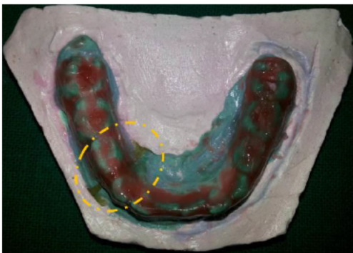
Figure 2: - Wax-spacer to blockout under cut

After mock surgery, the casts were held in their reduced positions and proper occlusion with the opposing maxillary cast was confirmed with the help of sticky wax. (figure 2)