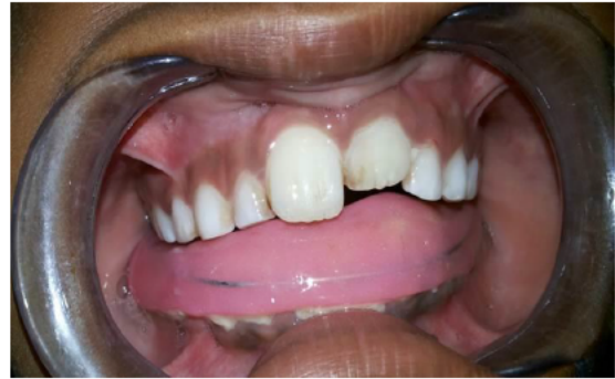
Figure 4: - Cementation of acrylic cap splint

The required adjustments were done after checking the occlusion of the patient, intraorally using articulating paper. Then the closed cap splint was cemented on the teeth using Type I Glass ionomer cement. (figure 4)