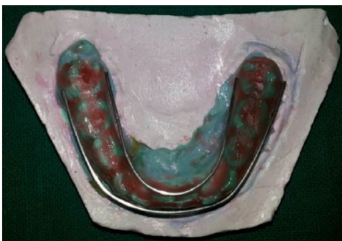
Figure 3: - U-shaped wiring

Both the upper and lower casts were stabilized and mounted onto an articulator. 19- gauge orthodontic wire was used for the adaptation of U shaped wire on buccal and lingual surface to reinforce the splint.