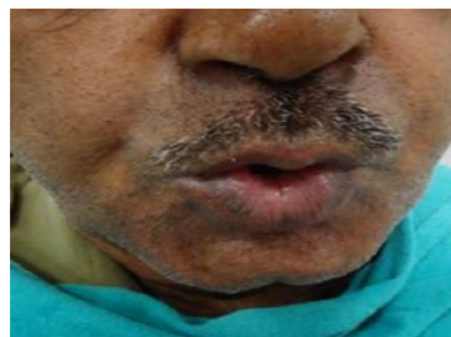
Figure 4: Patient performing functional movements

During these functional movements care was taken to ensure that the occlusal contacts between the maxillary and mandibular occlusal rims were maintained. The neutral zone in the patient's oral cavity was recorded with the help of functional moulding of the impression compound material, when the patient was instructed to perform functional movements. These movements were performed and repeated again after which the record base was removed along with the finished neutral zone impression. 6