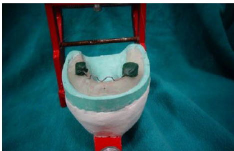
Figure 2: Mounted mandibular cast with vertical stops