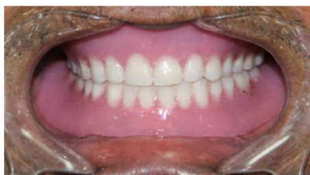
Figure 6: Maxillary and mandibular complete dentures in intercuspation