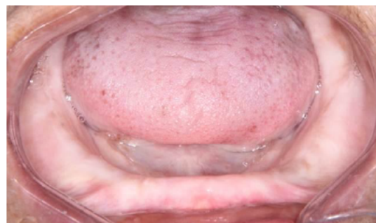
Figure 1: Intraoral view of mandibular residual ridge

Evaluation of previous prosthesis revealed severe loss of occlusal table of prosthetic teeth, staining of all surfaces and repaired fracture denture part. On intra oral examination revealed a severely resorbed mandibular alveolar ridge. (Figure 1)