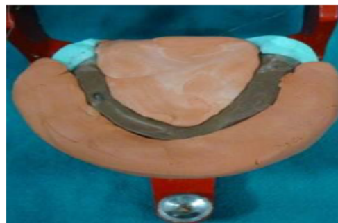
Figure 5: Neutral zone delineated by putty matrix