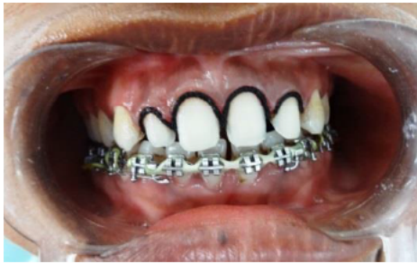
Figure 3: - Prepared and retracted teeth

that putty- light body wash relin impression was made using additional silicone material.