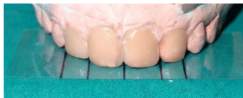
Figure 2: - Mock Wax Up and Preparation of a Template in accordance with golden proportion

The preliminary mock up wax up of the maxillary centrals and laterals were done in white ivory wax according to golden proportion, checked by a golden proportion template and the mock up work was checked and approved by the patient and a written consent was taken from the patient. (figure 2)