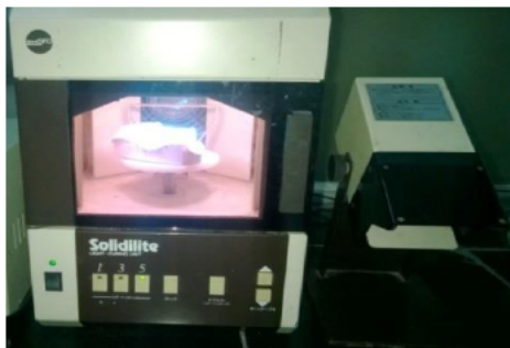
Figure 4: - Curing Inside Curing Chamber (Solidite Shofu)

The final impression was disinfected and casts were fabricated in Type IV die stone (Kalabhai MUMBAI). On the diagnostic wax up, putty index was made to fabricate the final prosthesis according to the approved diagnostic wax up. A light-cured hybrid composite (SOLIDEX SHOFU) was positioned at the inner surface of a silicon index and composite restorations of the four upper incisors were baked on the working model, and crowns were fabricated as per manufactures' instructions (SOLIDITE, SHOFU) (figure 4).