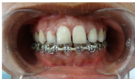
Figure 1: - Pre Operative View

A 26 year old female patient-concerned about her smile reported to the outpatient department. Clinical examinations reveal spacing between central incisors and lateral incisors. Also history reveals previous incomplete orthodontic treatment (figure 1).