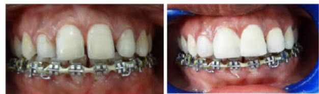
Figure 6: - Pre operative and Post-operative