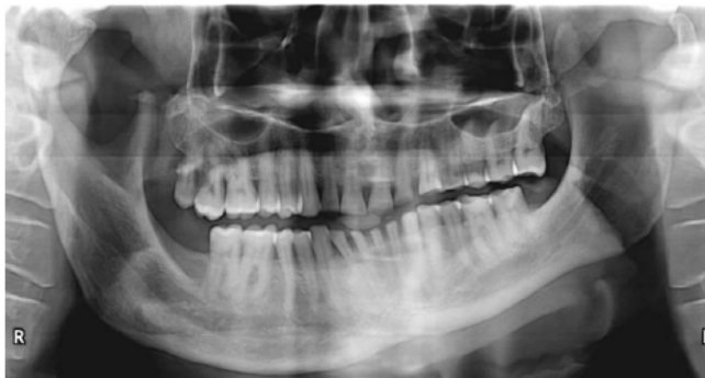
Figure 3: - OPG showing right sided enlargement of condyle and body of the mandible

Orthopantomogram(OPG) shows anterior lipping of condyle, bowing of inferior border of mandible on right side with an overlying thin radiolucent line which probably indicates areas of bone remodelling. (Figure-3, 4 A & B)