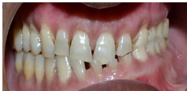
Figure 2: - Intraoral view showing mandibular midline deviation and occlusal crossbite.

Intraorally open bite was observed on the right side, midline deviation of about 2 mm, crossbite on left side. (Figure 2)