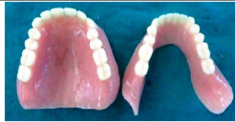
Figure 7: - Final denture after incorporation of female segment

The female component of Ceka Preci-Clix is available in 3 different colors i.e white (less retention), yellow (normal retention) and red (Increased retention). 2 The yellow female components were incorporated in denture with the black fixing tool and held with the chair-side rapid repair resin. The denture was inserted and occlusal equilibrations were carried out. Post insertion instructions were given to the patient and patient was recalled for checkup. A follow-up of 6 months reveals patient with healthy mucosa and successful rehabilitation using attachments. (Figure - 6, 7)