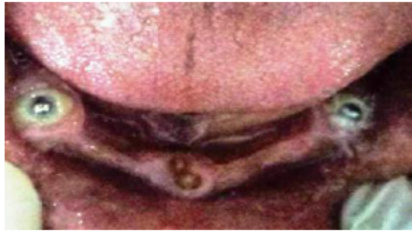
Figure 5: - Post placed in the endodontically treated tooth.

c) The fit of the post was confirmed and cementation of posts was carried out with Glass Ionomer Cement in luting consistency. (Figure-5)