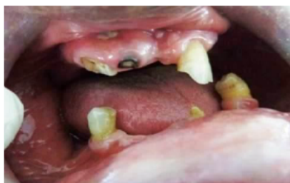
Figure 1: - Pre-Operative view.

An old medium built male patient of 62 years reported with the chief complaint of problem in chewing due to missing teeth since last one year. Patient was a public speaker and was concerned regarding the retentive features of his prosthesis. On clinical examination, the patient was found to have an acceptable bilateral symmetry with oval face form and a straight profile. The maxillary arch was having 13, 12, 21 and 22. In the mandibular arch, teeth present were 34 & 44 with root stump w.r.t 31. (Figure-1)