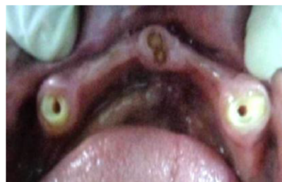
Figure 3: - Post space prepared in mandibular arch