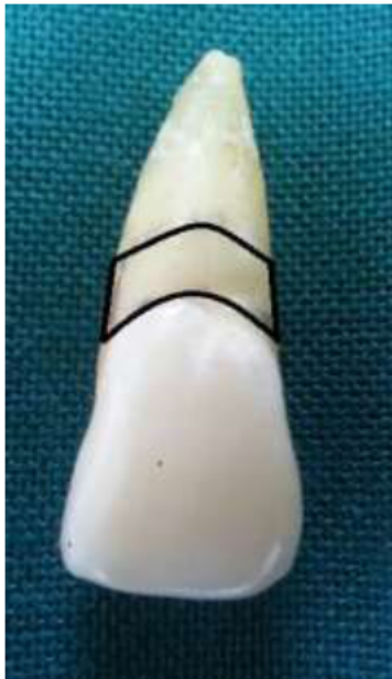
Figure 2: Determination of working zone.

root. This was taken as the instrumentation zone or the working zone. [Figure 2]