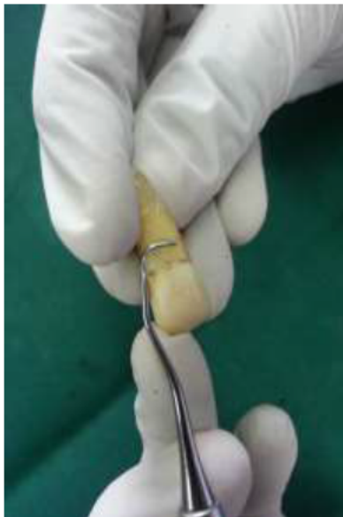
Figure 3: SRP done on the root surface.

Scaling was done on all the samples to remove calculus deposits on the root surface using a piezoelectric ultrasonic scaler with a vibrating frequency of 25KHz and a No: 10 scaler tip. Scaling was followed by root planing using a 1/2 Gracey curette. Each sample was subjected to 10 vertical strokes within the 4mm working area. 3 [Figure 3]