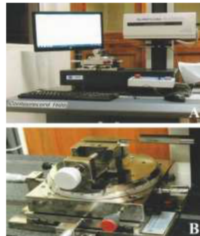
Figure 5: Contact Profilometer.

The surface roughness within the instrumentation zone of the root was determined using a contact profilometer. [Figure 5]