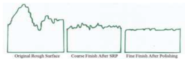
Figure 7: Diagrammatic representation of change in surface roughness

reduced the surface irregularities present on the root surface and resulted in a coarse finish. [Figure 7]