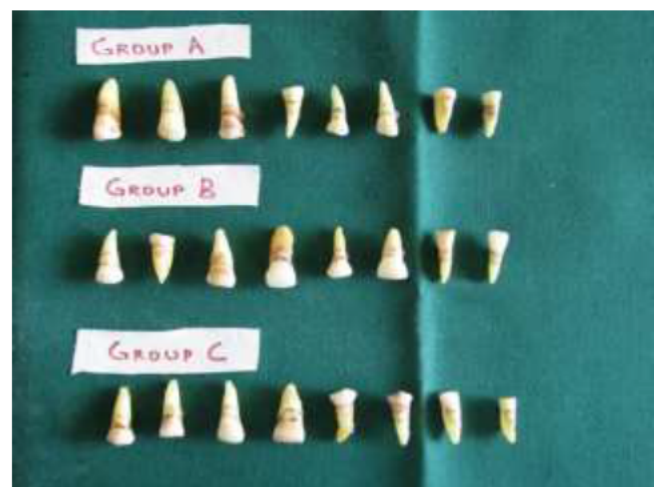
Figure 1: Grouping of extracted teeth.

The collected samples were divided into 3 groups: Group A, group B and group C with each group consisting of 8 teeth. [Figure 1]