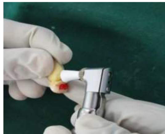
Figure 4: Polishing of the root surface.

Polishing was done using a slow speed hand piece at a speed of 2500 rpm and a standard webbed polishing cup. Polishing was done on each sample for 5 seconds. 4 [Figure 4]