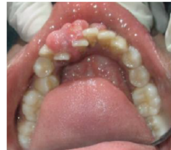
Figure 2: Lingual view of the lesion.

Based on these findings a provisional diagnosis of pyogenic granuloma was made. Further a differential diagnosis of peripheral ossifying fibroma, peripheral giant cell granuloma was considered. Patient was subjected to intra oral periapical radiograph examination which showed no visible bone involvement. [Figure 3]