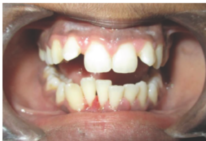
Figure 4: After surgical excision.

Later with the patients consent an excisional biopsy was performed under aseptic precautions and under bilateral mental nerve block and lingual infiltration, the lesion was split into two halves (buccal and lingual) using electrocautery. The buccal half was elevated using a periosteal elevator upto the base. Then the base of the buccal half was excised closed to the cervical line of the teeth using a combination of scalpel and electrocautery. Haemostasis was achieved followed by placement of Coe pack. The postoperative period was uneventful. [Figure 4]