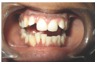
Figure 6: Follow up view after 2 years.

These features confirmed the diagnosis of peripheral ossifying fibroma. Patient was reviewed consequently two times with in a period of two year, with no known recurrence. [Figure 6]