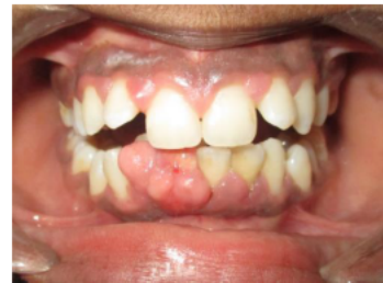
Figure 1: Labial view of the lesion.

noted. The lesion was asymptomatic, and showed no clinical evidence of ulceration. [Figures 1&2]