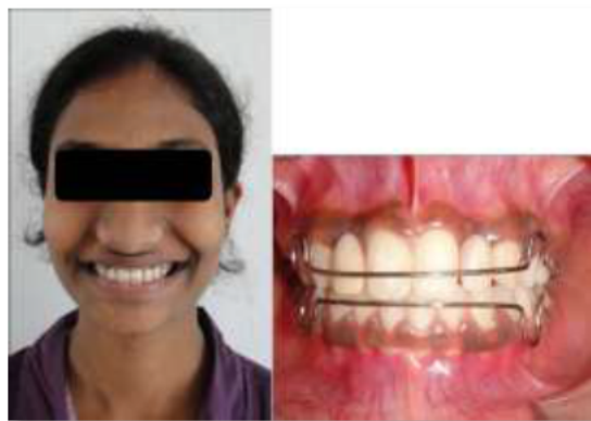
Figure 7: - Retainers