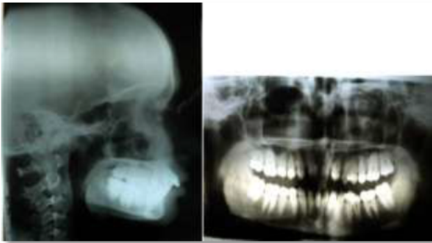
Figure 2: - Pre Treatment Lateral Cephalogram and OPG The patient was presented with option of non-extraction treatment with fixed functional appliance.

The primary purpose of orthodontic treatment was to attain a Class I canine and molar relationship and create space for replacement of upper lateral incisors.