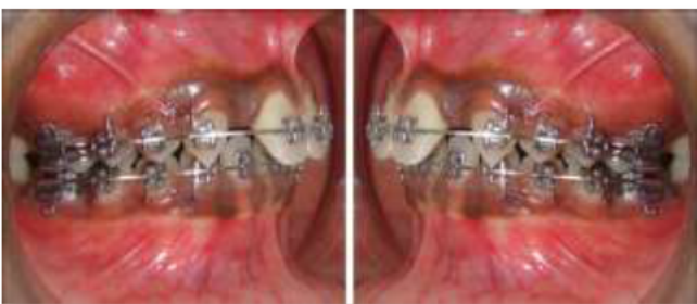
Figure 3a: - End of Retraction

At the end of retraction the upper and lower arches were consolidated. The space between upper canine and central incisor was maintained by a plastic sleeve on both sides. Lower 19 X 25 stainless steel wire was placed with U loop between the canine and premolar on each side for the attachment of push rod of forsus appliance. The brackets