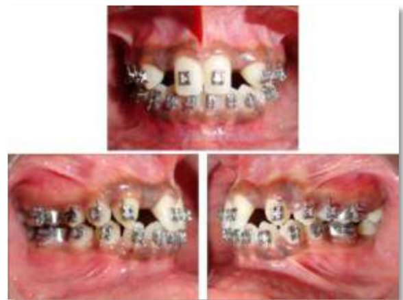
Figure 5: - Post Forsus FRD

The Forsus appliance was left in place for 6 months. After 6 months Class I molar and canine relation was achieved. This was followed by settling of occlusion and final finishing and detailing. Figure 5