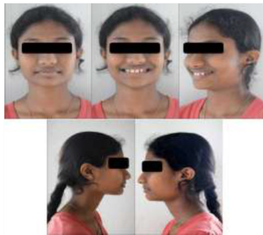
Figure 1a: - Pre Treatment Extra-oral Photographs

The Treatment objective in this case was to achieve an aesthetically harmonious soft tissue profile by reducing the patient's facial convexity and increasing her lower facial height. The occlusal goals were to achieve a Class I molar relation, Class I incisor relation, obtain a normal overjet, overbite and replace the missing lateral incisors.