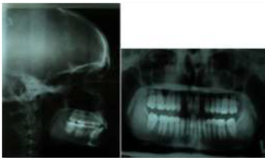
Figure 8: - Post Treatment Lateral Cephalogram and OPG