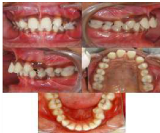
Figure 1a: - Pre Treatment Intra-oral Photographs