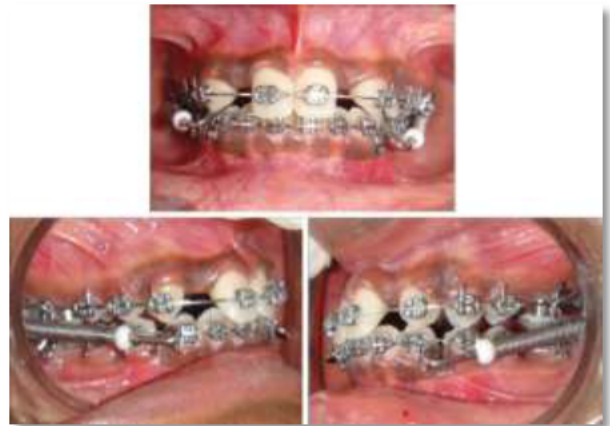
Figure 4: - Placement of Forsus FRD

Following this Forsus FRD was installed to advance the mandible and correct the molar and canine relation. Fig 4