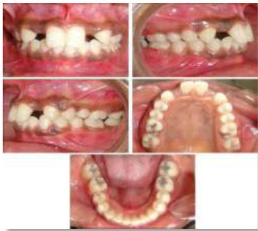
Figure 6b: - Post De-bond Intra Oral Photographs

After 5 months of finishing and detailing the appliance was de-bonded. Maxillary and mandibular wrap around retainers were given with artificial upper lateral incisors in the maxillary retainer and final records were taken. Figure 6a – 6b, Figure 7, Figure 8.