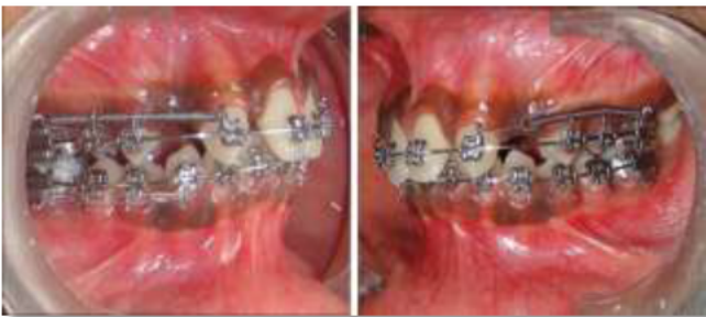
Figure 3a: - Canine retraction using Ni-Ti coil spring

After initial alignment, upper and lower 19 X 25 stainless steel wires were placed and the upper canines were retracted using Ni-Ti coil spring. (Figure 3a, 3b)