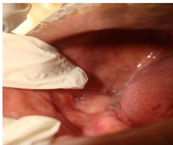
Figure 2: - Intraoral photograph showing swelling at right alveolar mucosa irt 44 & 45 obliterating buccal vestibule

On palpation number, site, shape, size margins and extensions were confirmed. Swelling is firm to hard in consistency and is not associated with any kind of discharge. (Figure 2)