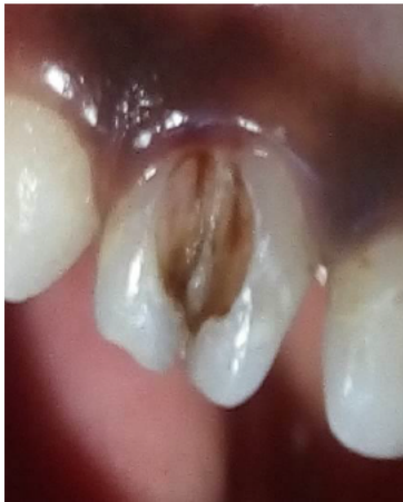
Figure 3: - After excavation of caries from the labial surface.

After administration of local anaesthetics, direct excavation of caries was done with spoon excavator and all the caries were removed from both labial and lingual surfaces of the fused supernumerary tooth and the right maxillary lateral incisor (figure 3).