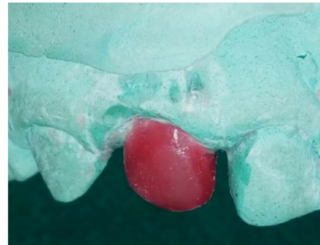
Figure 5: - Wax-up to mimic the final esthetic contour of the single lateral incisor

Alginate impressions of both the upper and lower arches were taken and the models were poured using dental stone. The supernumerary tooth was scraped off on the model and a laboratory wax up was done to mimic the final esthetic contour of the single lateral incisor. (figure 5)