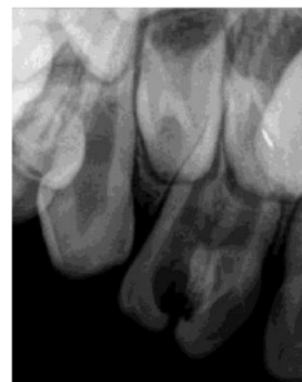
Figure 2: - Preoperative radiograph showing fusion of supernumerary tooth with maxillary right lateral incisor.

On radiographic examination, there was fusion of supernumerary tooth with maxillary right lateral incisor with two crowns in two roots. (figure 2)