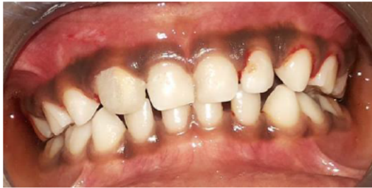
Figure 9: - Post operative photograph.