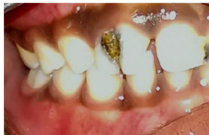
Figure 1: - Preoperative photograph showing supernumerary tooth along with maxillary right lateral incisor.

A 3 year old girl reported to the department of pedodontics and preventive dentistry with the chief complaint of decaying of upper front tooth region in the right side. The patient was asymptomatic 5 to 6 months back then her parents noticed blackish discoloration of the upper front tooth which increased with time. There was no family history of dental anomalies. General and extra-oral examinations appeared non-contributory. Intra-oral examination revealed the presence of an extra tooth, fused with maxillary right lateral incisor with caries on the line of developmental groove in the labial and palatal aspect. (figure 1)