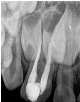
Figure 4: - After obturation with Zinc-oxide eugenol

The excavation of the caries from the labial surface led to direct access into the canals. Shaping and cleaning of the canals was performed by using K-files and H-files (MAILLEFER, DENTSPLY India Pvt Ltd, Delhi, India). Irrigation of the root canals at every step was done with betadine and normal saline. The root canals were dried filled with zinc-oxide eugenol (Mfg, Deepak Ent, Ganeshdham, India).