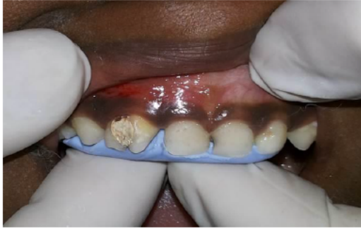
Figure 8: - Stent in mouth to build up palatal, proximal and incisal aspects.

Final finishing and polishing of the composite was done using finishing burs and composite kit (SHOFU, SHANK CA, PN0310, Shofu Dental Corporation, USA). A follow up was done with the patient after one month and a clinically acceptable result was obtained. (figure 9)