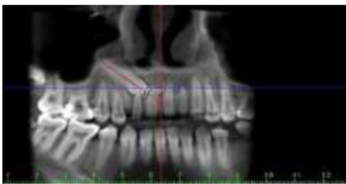
Figure 1. Canine angulation in relation to the midline.