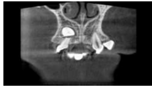
Figure 3. Severe root resorption in a lateral incisor.

more than half of the dentin-pulp thickness), severe resorption (pulp exposure by the resorption). [Figure 3]