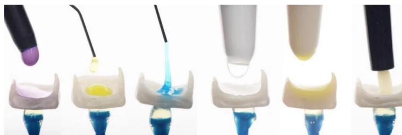
Figure 1. Recent bioactive dental materials used in dentistry.

An overview of recent bioactive dental materials used in dentistry is presented in Figure 1 .