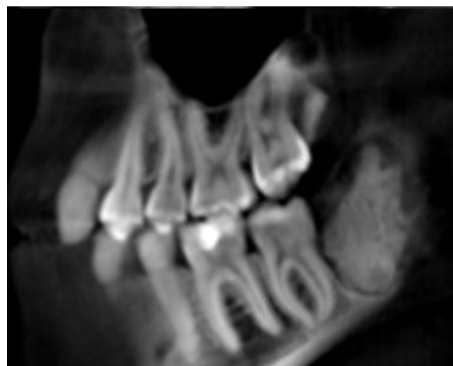
Figure 2. Root length of maxillary left first molar