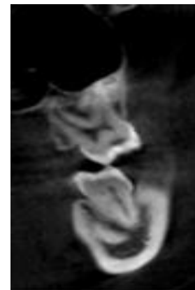
Figure 3. Palatal root length of the maxillary right second molar